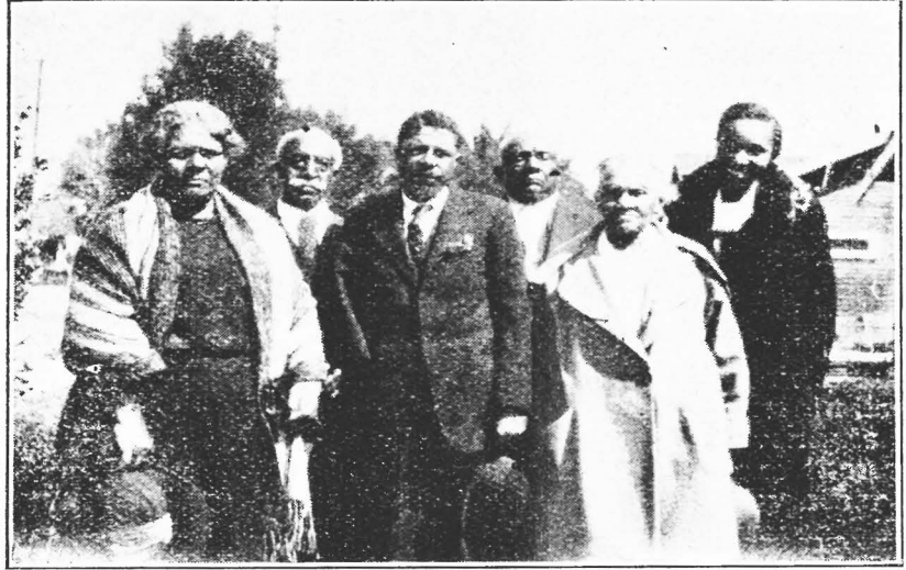
Members of the Berean Church of Free S. D. A., Los Angeles, Calif.