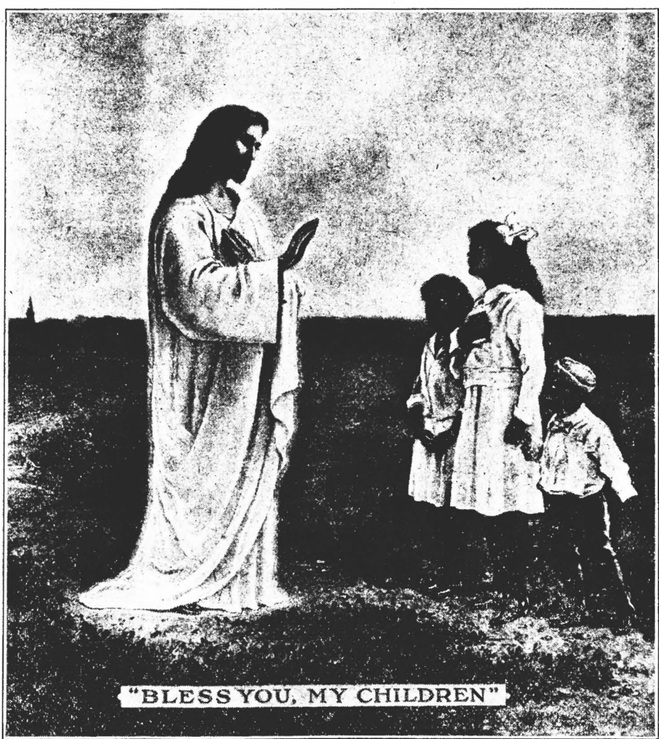
"BLESS YOU, MY CHILDREN"